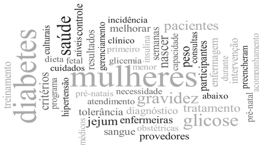
Figure 2. Figure showing the word cloud organized based on the Max QDA Plus software. Maringá, PR, Brazil, 2021

As it is a bibliographic research, authorization from the Ethics Committee was waived, as it does not involve studies with human beings.